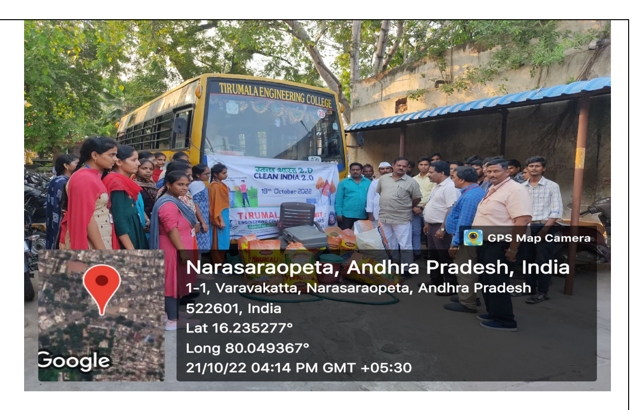
Principal sir and NMC Commissioner along with NSS Pos and volunteers