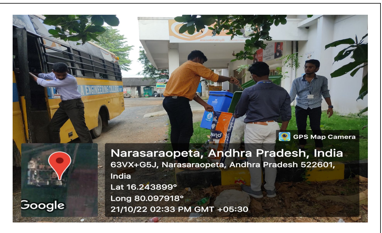
NSS Students of TEC participated in solid waste collection for NMC