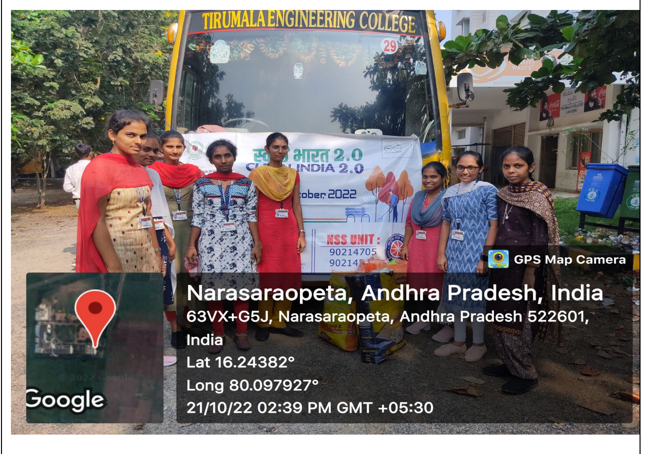
NSS Students of TEC participated in solid waste collection for NMC